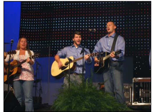
Members of the Patriots Chorus sing at the VFW National Convention.

From the Patriots Chorus to the Buddy Poppy Child, the 2007 Convention was a fun time to spread the message about the National Home, its residents and ways to get involved.